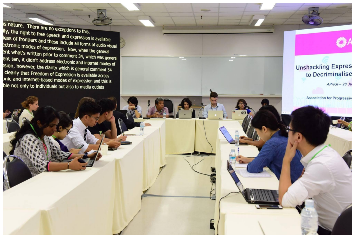
APrIGF 2017: live scribe screen on the left