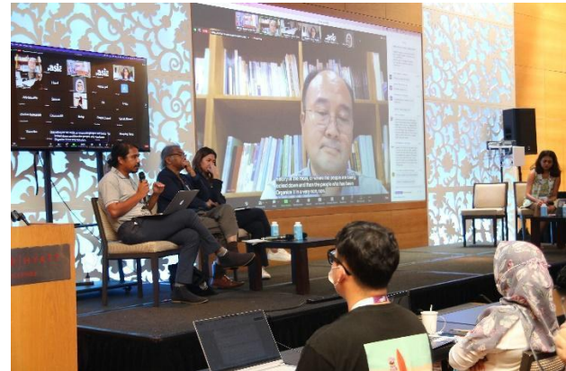
APrIGF 2022: remote participant screen