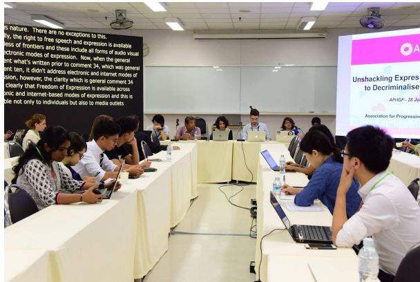
APrIGF 2017: live scribe screen on the left

2021 Meeting Archive Reference: https://aprigf.org.np/program-schedule/