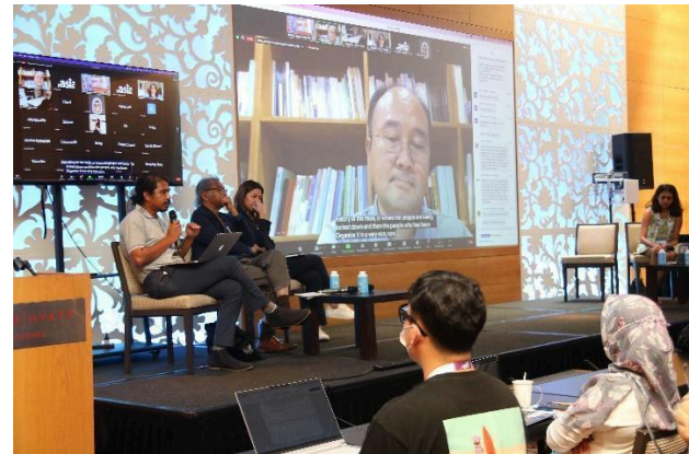
APriIGF 2022: remote participant screen