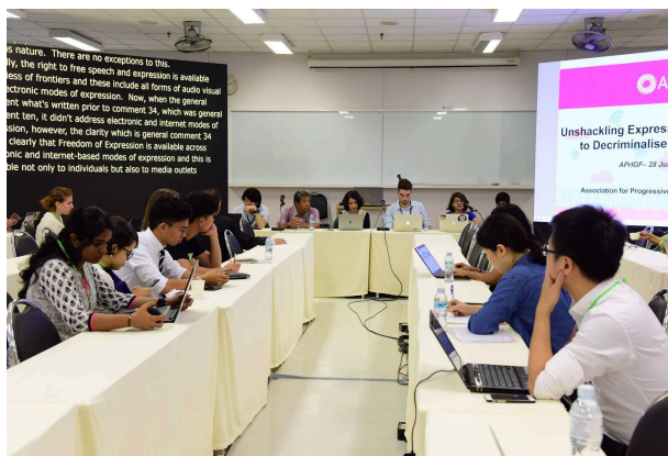
APriIGF 2017: live scribe screen on the left

2024 Meeting Archive Reference: http://2024.aprigf.asia